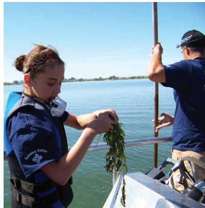
WATER QUALITY INSTITUTE STUDENT ASSESSING CURLY LEAF POND WEED IN MOSES LAKE.

Blessed with water as the pulse and power of the Central Basin, the District began Water Quality Institute classes in 2007 to anchor local students in the history of Moses Lake, its huge watershed and how lake rehabilitation supports the entire community. Each summer, students partake in both classroom and on-the-water experiments with specially trained experts in biology, science and education. Rigorous coaching and water quality testing by students includes sampling for oxygen, temperature, bacteria, turbidity, phosphates, nitrates and solids. Graduates of the Institute, in turn, mentor other students, design their own presentations and leave the lake with team-building skills, better prepared for life, to pursue science or higher education in any discipline. MLIRD has awarded $3,750 in private scholarship donations to high school students in the Water Quality Institute.