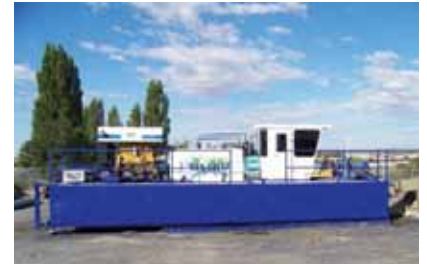
SEDIMENT DREDGE – STAFF SETTING UP FOR TRANSPORT TO PARKER HORN.

Look for more about this project in the next edition of Lake View.